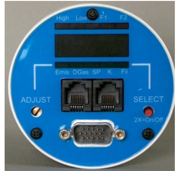
USER CONTROL INTERFACE